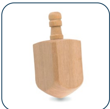
Blank wooden dreidel